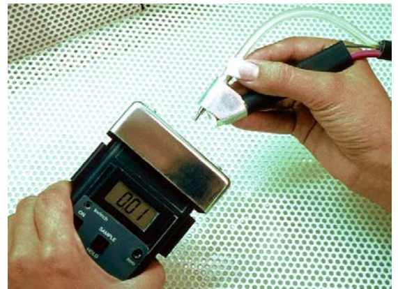
Optional: ESD Field Meter for testing system