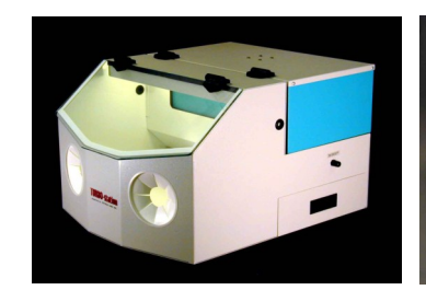
TURBO-Station™ with side view and open clean out drawer