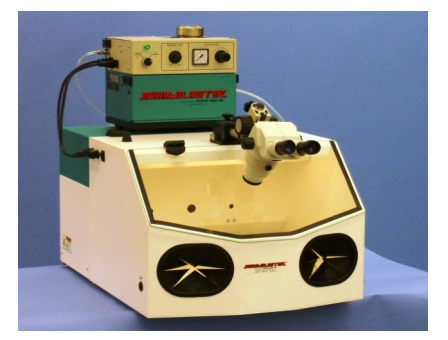
TURBO-Max™ with a SWAM –Blaster® Model MV-2L