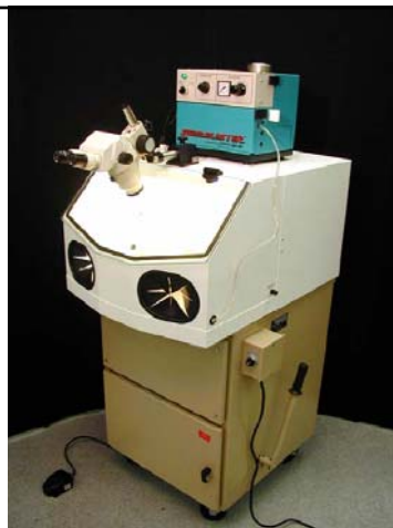
The SWAM® Complete Work Cell with SWAM-Blaster® Model MV-241 Microscope Accessory

The SWAM-BLASTER® line of Micro Abrasive Blasters are accurate and precise. Independently adjustable powder flow control and air pressure regulation make an exceptionally large window of capability. Wide range of abrasives and sizes can be used.