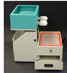
TURBO-Station™ with side view and open clean out drawer

The TURBO-cab™ is the perfect solution when work items are small and bench or counter space limited.