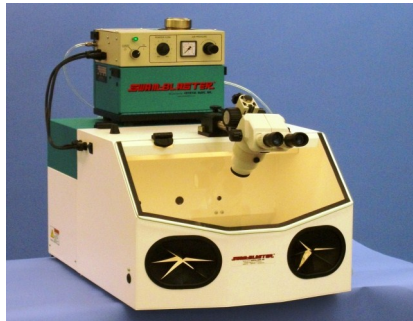
TURBO-Max™ with a SWAM –Blaster® Model MV-2L